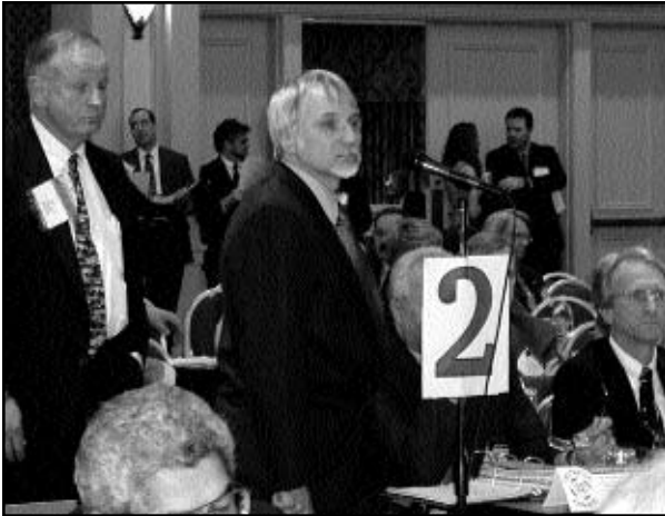
Delegates raise questions during an HOD session.