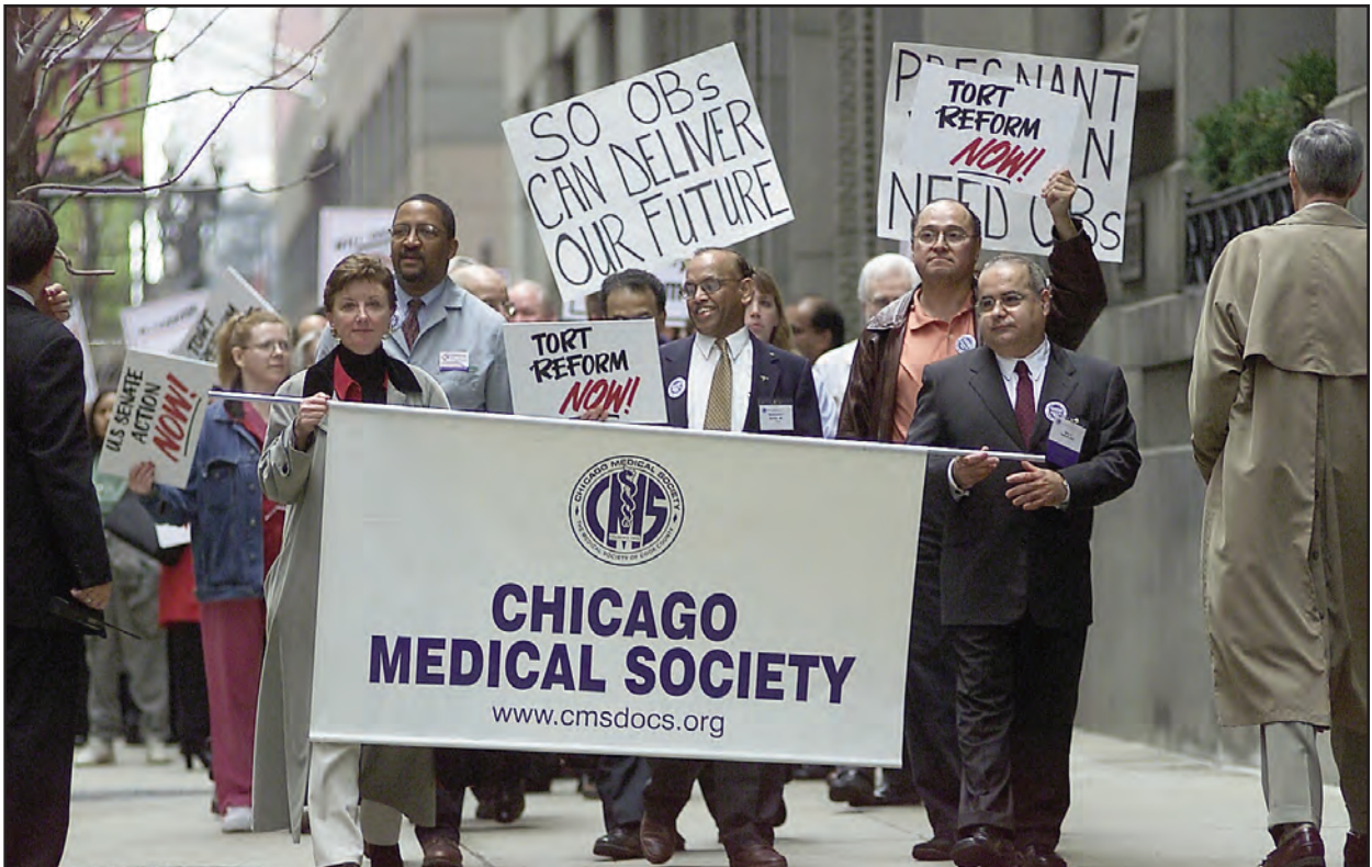
Shouting “Tort Reform Now!” physicians show their concern as they make their way through downtown Chicago in an historic CMS-sponsored rally on March 26, 2004.