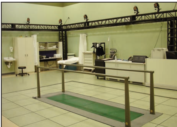
Equipment like this is used in rehabilitation regimens that give many military amputees the option of serving their country as "warrior athletes" again.

Such injuries prompted leaders to examine the care they provided for that population as well. Thanks to the latest rehabilitation regimens and high-tech prosthetics, many military amputees can opt to continue to serve and live the active "warrior athlete" lives they'd enjoyed before they were injured, Col. Scoville said.