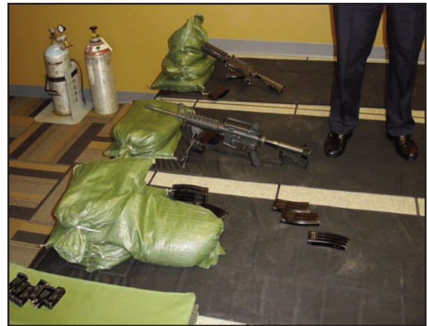
Assault rifles have been specially designed for use by soldiers with prosthetics.

We started with an impressive tour of the physical rehabilitation services for service members with limb loss. There is specialized exercise equipment, cutting-edge, life-like prosthetics technology, interactions with therapeutic and service dogs, and even computerized programs similar to an oversized Dave and Busters virtual reality game designed to improve balance and agility.